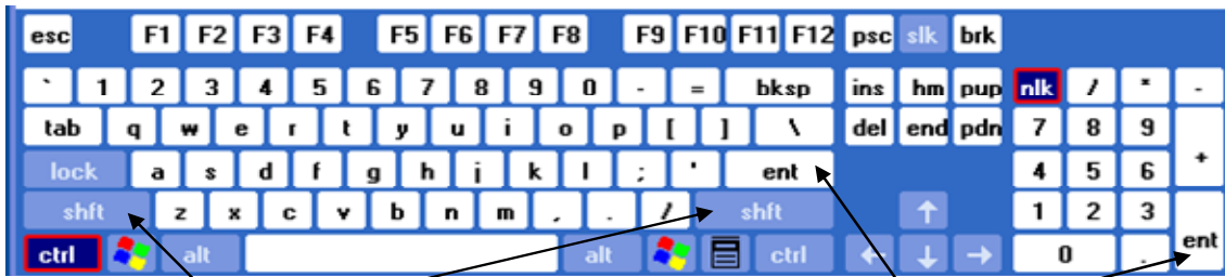
( 2 ) SHIFT Keys

The SHIFT keys, shift between Upper Case and Lower Case characters ( capital letters and standard letters ). They also enable you to select the "special" characters at the top of some of the keys (such as the number keys)